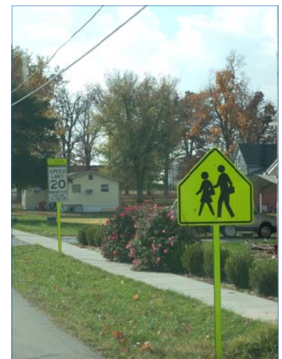
BELOW: Safe Kids Springfield worked with the City of Billings to make pedestrian improvements around their school.