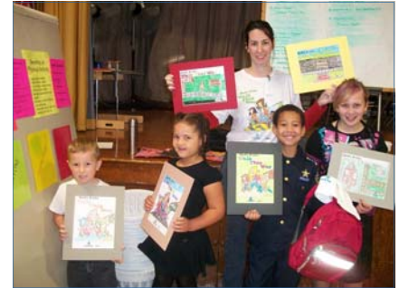
ABOVE: Walk This Way poster contest winners from Delaware Elementary.