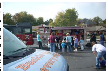
AT RIGHT: Ozark Fire Department and Safe Kids team up at Christian County Library.

Safe Kids Springfield partnered with local preschools and fire departments this fall to offer a special fire-prevention focused Safety Storytime for Preschoolers. This program brought children and family members together to learn about child safety issues, while having fun doing hands-on activities and crafts, and reading some great safety storybooks. Participants were each given a copy of the Brecker Bunny Learns Fire Safety storybook, provided by Safe Kids Springfield.