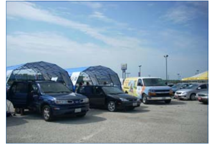
ABOVE: Cars line up at the Marshfield Chevrolet event.

A successful CPS technician course was held at the Battlefield Fire Protection District Headquarters in July with 6 new technicians receiving their certification. The December 2010 class to be held at Ozark Fire Department is already full and has a waiting list. The instructor team is looking at 2011 schedules to accommodate the interest from area organizations. For more information about the child passenger technician certification program, visit http://cert.safekids.org